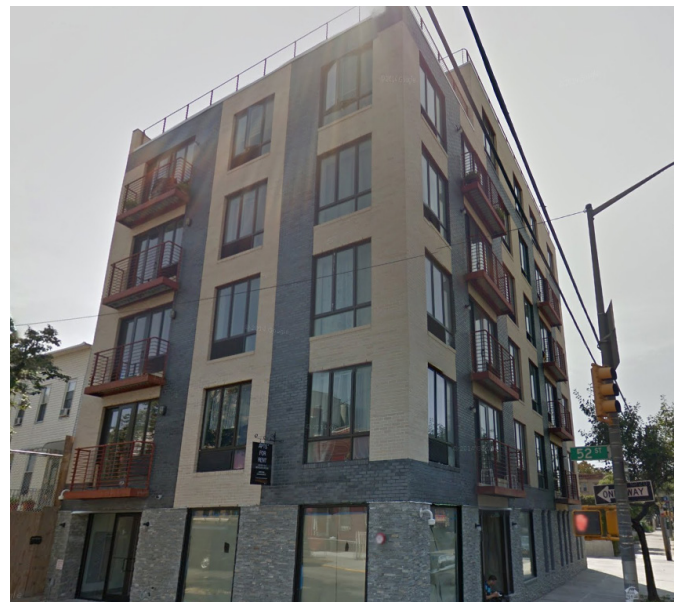
314 52ND STREET | BROOKLYN NY