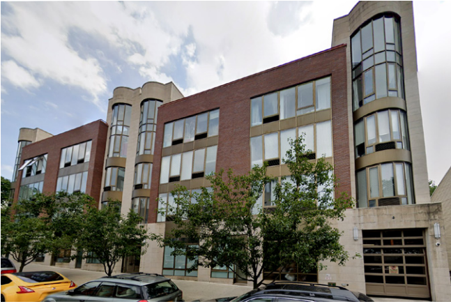
198-210 16TH STREET | BROOKLYN NY