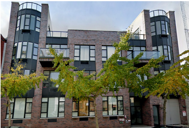
225 15TH STREET | BROOKLYN NY