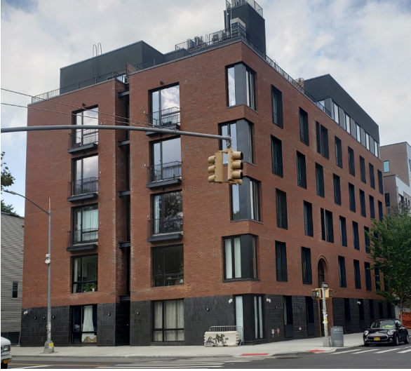
426 TOMPKINS AVENUE | BROOKLYN NY