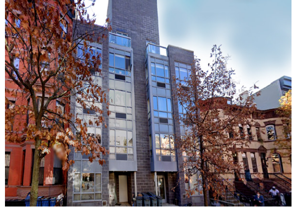
234 GREENE AVENUE | BROOKLYN NY