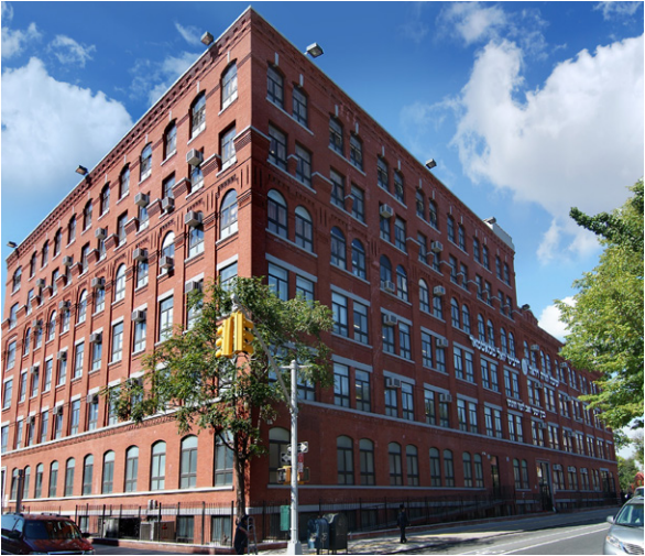
762 WYTHE AVENUE | BROOKLYN NY