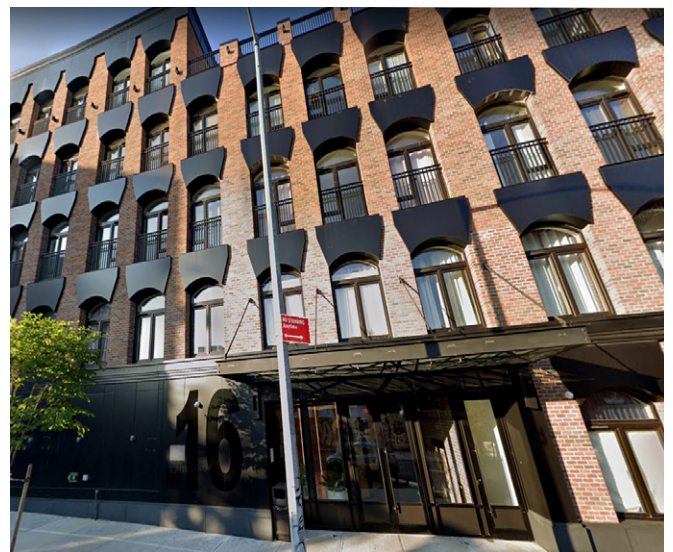
16 CHARLES PLACE