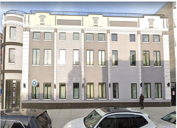
783 KNICKERBOCKER AVENUE | BROOKLYN