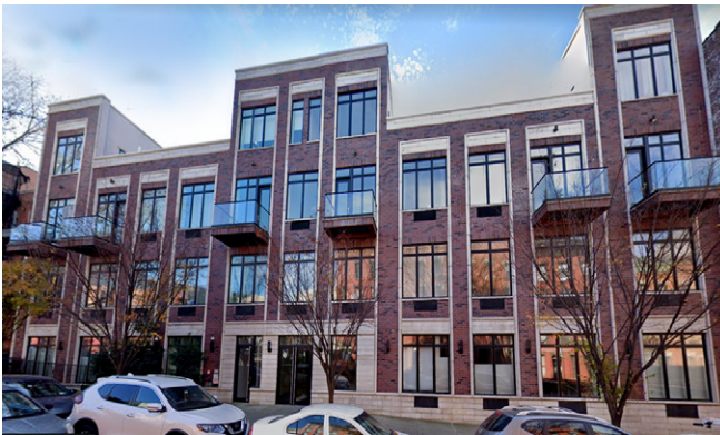
182 15TH STREET | BROOKLYN NY