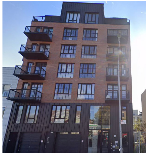
2288 ATLANTIC AVENUE | BROOKLYN NY