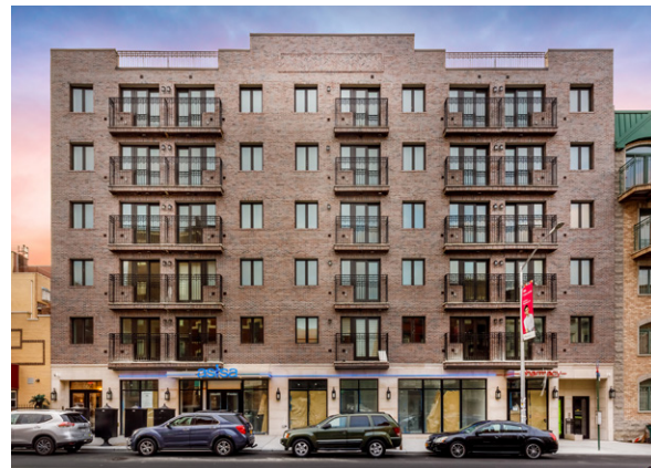
667 MYRTLE AVENUE | BROOKLYN NY