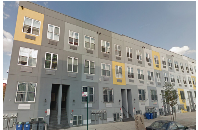
587 CENTRAL AVENUE | BROOKLYN NY